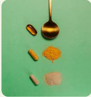
Health Supplements & Superfood Powders