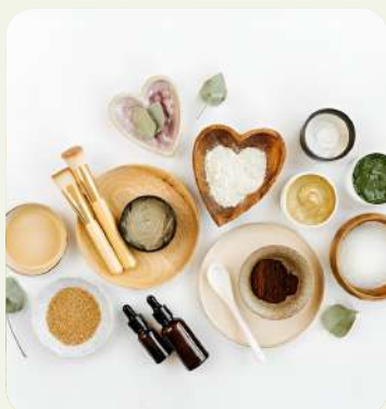
Ayurveda Based Cosmetics