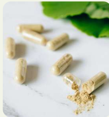
Ayurvedic Tablets & Capsules