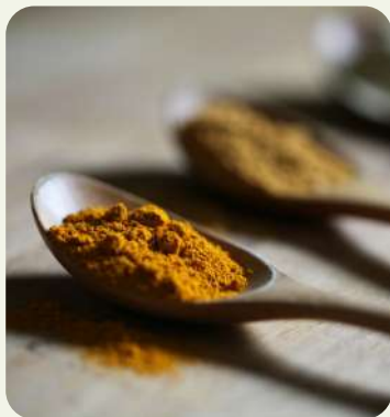
Spray Dried & Dehydrated Powder